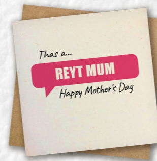
Yorkshire Reyt Mother's Day Card