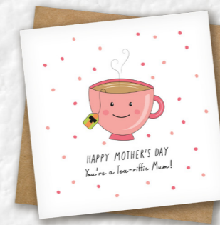
Tea-riffic Mum Mother's Day Card