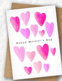
Wishful Hearts Mother's Day Card