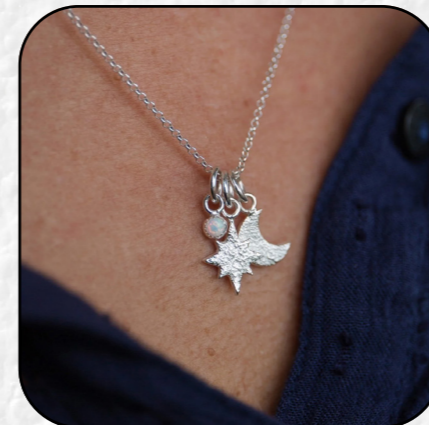
Birthstone Star and Moon Pendant

@claymorecandle.co www.claymorecandle.co