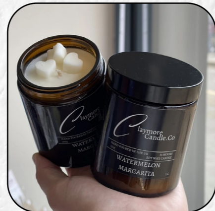
Watermelon Margarita Candle

Soy wax candle with a sweet distinctive smell of freshly squeezed watermelon juice, kiwi and lime, subtly blended with tequila and hints of crisp green florals.