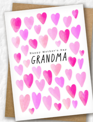
Wishful Hearts Mother's Day Card