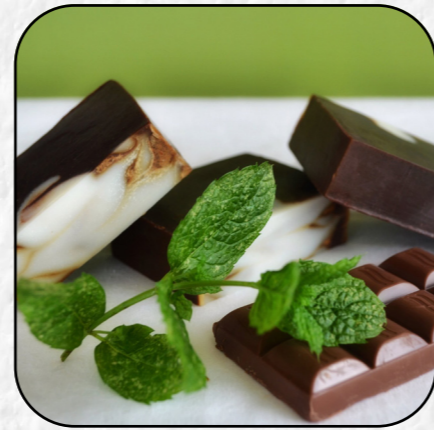
Handmade Mint Chocolate Soap

We hope you enjoy our 'top 10' finds! All lovely pressie ideas, perfect for someone special this Mother's Day!