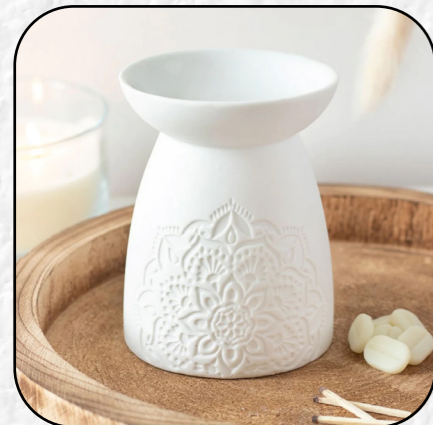
White Mandala Ceramic Oil Burner

This charming white ceramic oil / wax melt burner offers a minimal and sleek design, with mandala decorating the front and top dish. Place wax melts or fragrance oils to the dish to enjoy.