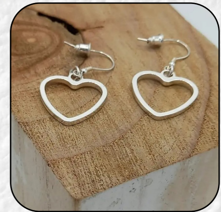
Silver Hollow Heart Earring

A beautifully crafted symbol of love and style. These earrings feature a delicate and intricately designed hollow heart motif, creating a look that is both romantic and modern.