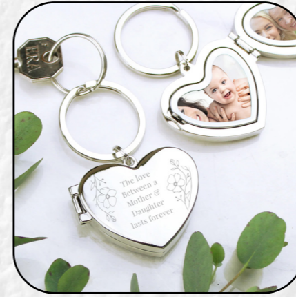
Personalised Heart Photo Frame Keyring

@rivelinvalleysoapco www.rivelinvalleysoap.co.uk