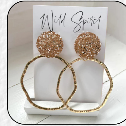
Gold Disco Hoop Earring

These fabulous Disco Hoop Earrings are the perfect accessory for so many outfits. Add some boho glam with these gold hoops that will sparkle in the light.