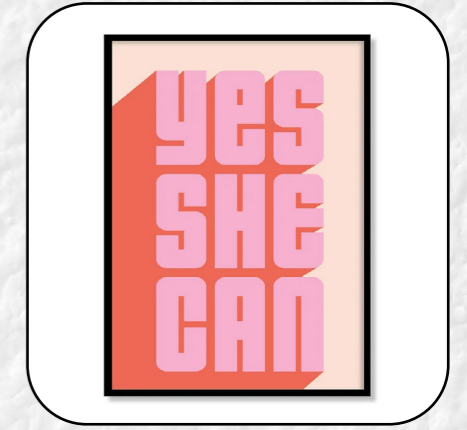
YES SHE CAN Inspirational Print

This vibrant print is a perfect reminder that anything is possible! Featuring a bold and colourful design this print is inspiring and motivating.