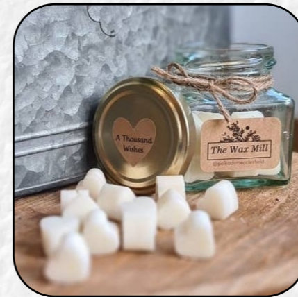
The Wax Mill Melt Hearts