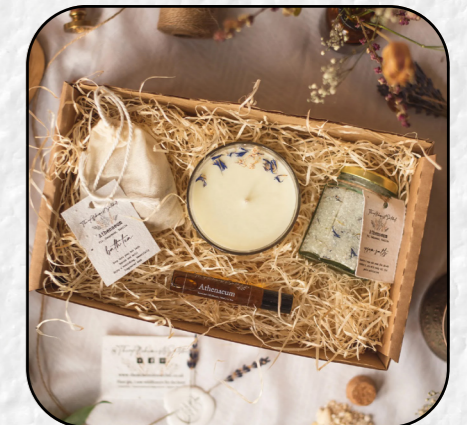
Athenaeum Bath Spa Set

Athenaeum, sharp fir needle essential oil, musky cedar wood, and sweet vanilla undertones. This set includes a large scented candle, bath salts, a bath tea and an aromatherapy roller bottle.