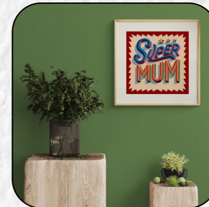
Super Mum Art Print

@lucykempjewellery www.lucykempjewellery.co.uk