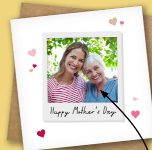
Personalised Mother's Day Photo Card