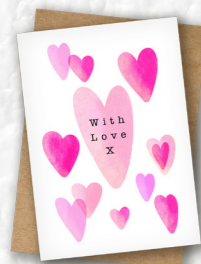
Wishful Hearts With Love Card