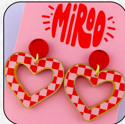
Checkerboard Heart Shaped Earrings

@polkadottecclesfield www.polkadottshop.com