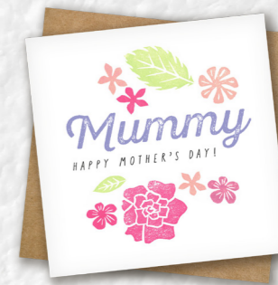
Stamped Flowers Mother's Day Card