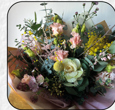
Fresh Flower Bouquet

This is the florists choice. A country handtied bouquet using seasonal blooms (please note blooms will change through out the seasons). Order online and collect from Polka Dott from the next day.