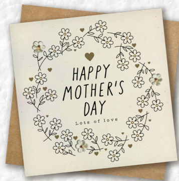
Paper Flowers Mother's Day Card

Hilda & Dolly presents the wonderful Mother's Day card collection. There's many more to look at online so be sure to take a look here .