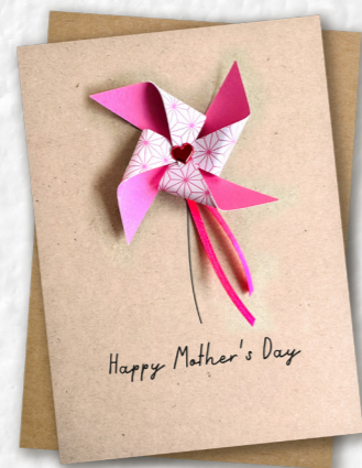
Windmill Mother's Day Card